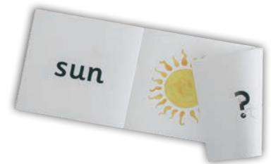
From Read & See, Pack 1: First Words